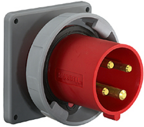
Watertight IEC Pin and Sleeve Inlet, 2P3W, 100A 125V